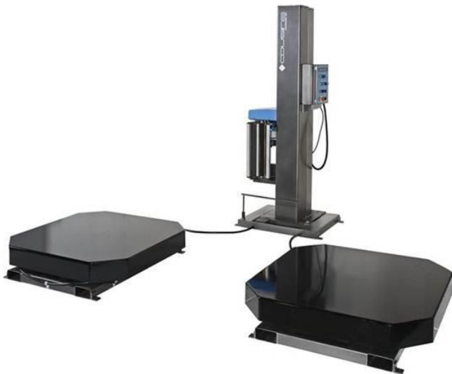
HP (high profile model)

The main advantage of a dual turntable machine is the ability to have one pallet being wrapped while the operator brings another to the second turntable. The operator can continuously alternate loads with the two turntables which will increase productivity. The dual turntable option is available in both low profile (LP) and high profile (HP) models.